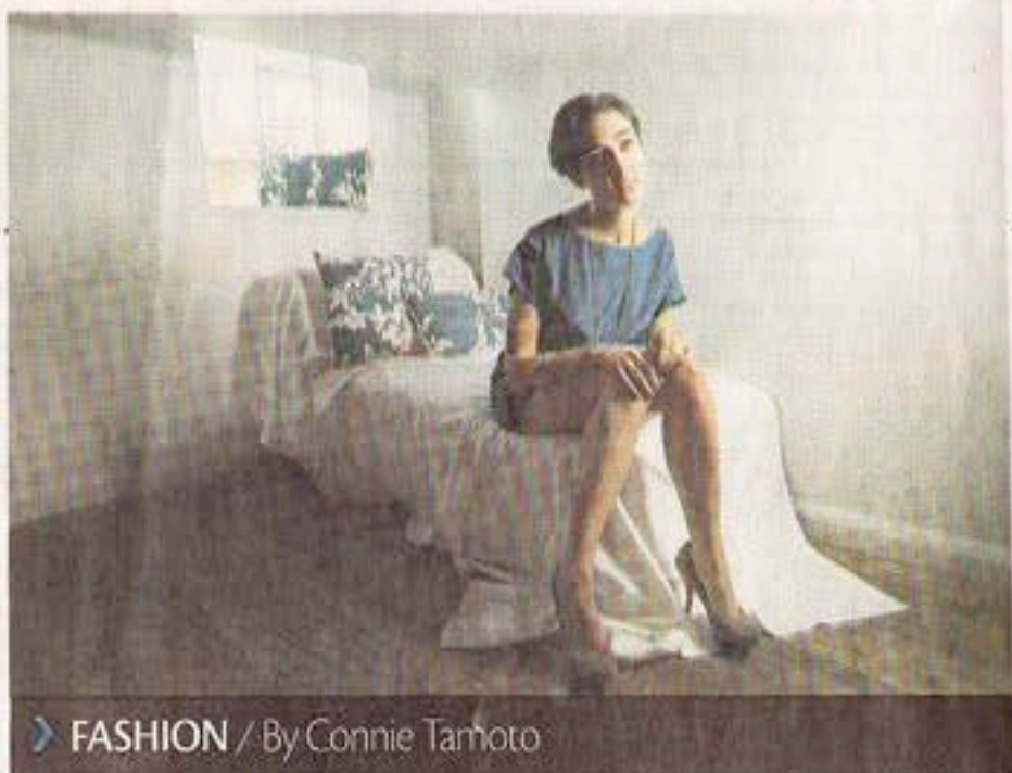
➤ FASHION / By Connie Tamoto

Left, 100 per cent silk dress by Josh Podoll, $279; necklace made of 12 vintage necklaces by DLC, $289; Olsen Haus shoes made with recycled TV-screen platform sole, cork heel and vegan upper, $289; hemp/organic cotton pillows with chemical-free dye and eco fill by Amenity, $69.